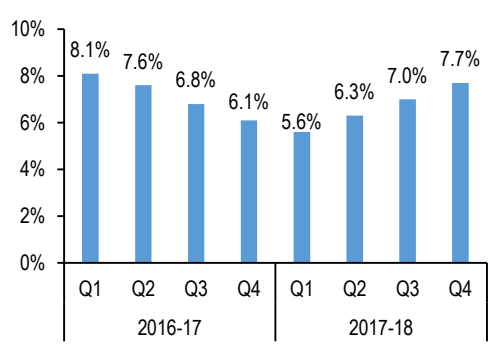
Figure 1: GDP growth (in %, year-on-year)

Provisional estimates suggest that the Gross Domestic Product (GDP) (at constant prices) of the country is expected to be at 6.7% year-on-year. <sup>1</sup> GDP grew at 7.7% in the fourth quarter of 2017-18, over the corresponding period a year ago. <sup>1</sup> This was higher than the 7% growth in the third quarter of 2017-18. The quarterly trend of GDP growth over the last two financial years is shown in Figure 1.